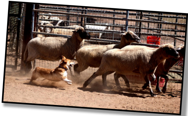
Morriston, FL is located due west of Ocala.