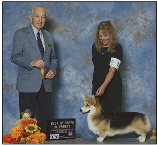
Cindy and "Bryce" Capri Brogan Summer Breeze going Best of Breed from the BBE Class