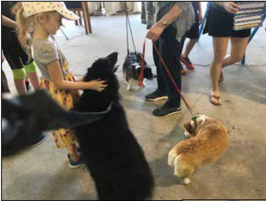
Elsi the Pembroke Marilyn the Cardigan Pucci the Belgian