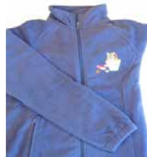
Specialty Logo Microfleece Jacket $10.00