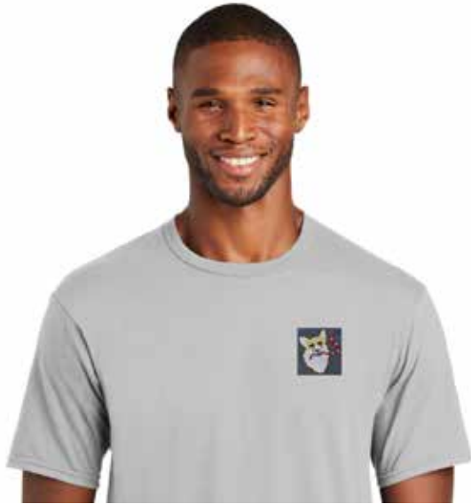
2019 Specialty Logo Unisex Tee $25.00