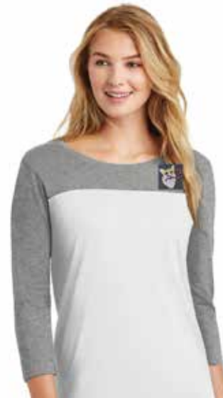
2019 Specialty Logo Ladies Tee $30.00